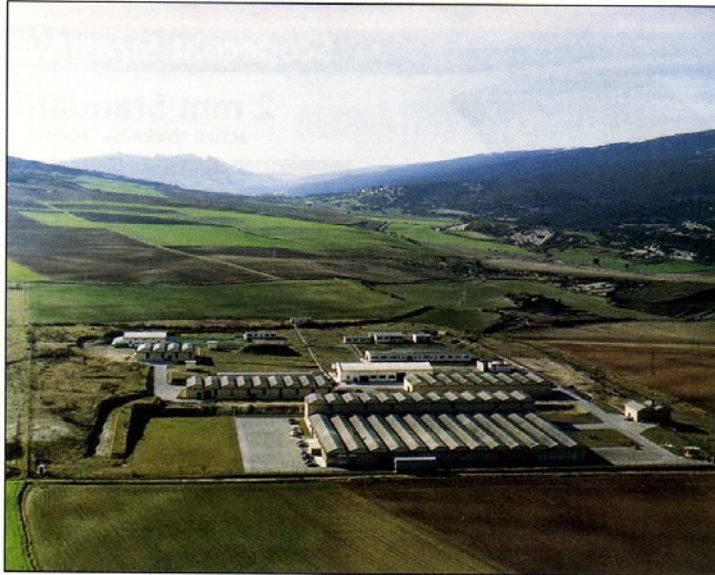
Rio Ammunition's manufacturing facility in Spain

Rio ammo is competitive on price, but its not cheap